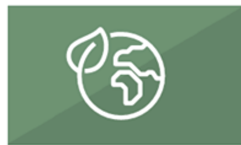
Exhibit 3: Morocco Sovereign Debt – ESG Assessment