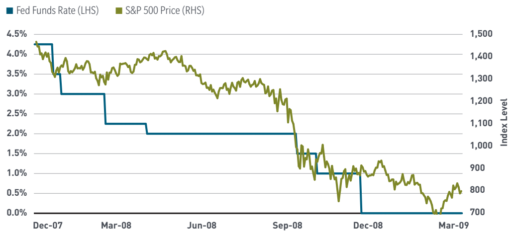
Exhibit 2: ...Or after the collapse of the housing bubble

Source: Bloomberg. Daily data from 31 December 2007 to 31 March 2009.